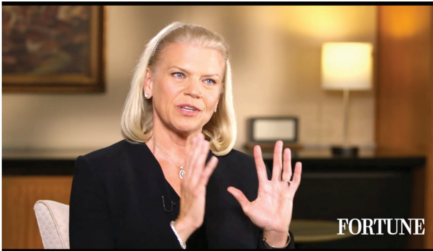
Virginia Marie "Ginni" Rometty is an American business executive. She is the current Chairman, President and CEO of IBM, and the first woman to head the company.

So when I talk to all of my colleagues in other industries, the same things we experience in reinventing our company are the same things they're experiencing. You've got to keep reinventing.